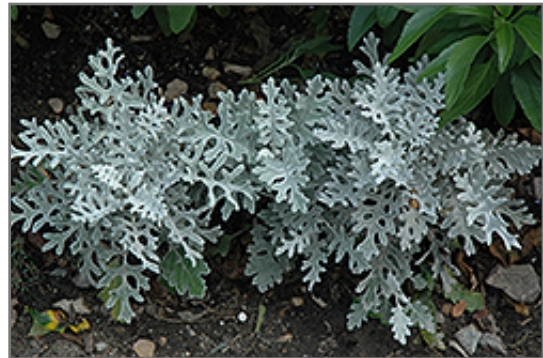
Silver Dust Dusty Miller foliage