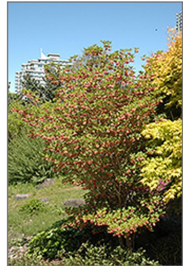
Redvein Enkianthus in bloom

BRUNSWICK 422 Bath Road Brunswick, ME 04011 1-800-339-8111 207-442-8111