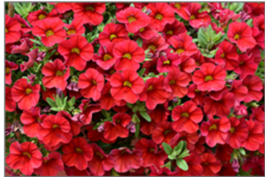
Superbells Red Calibrachoa flowers

Superbells Red Calibrachoa is recommended for the following landscape applications;