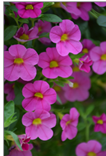
Superbells Pink Calibrachoa flowers

Superbells Pink Calibrachoa is recommended for the following landscape applications;