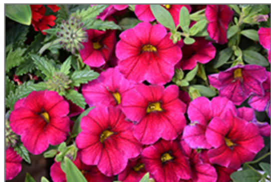
Superbells Cherry Red Calibrachoa flowers