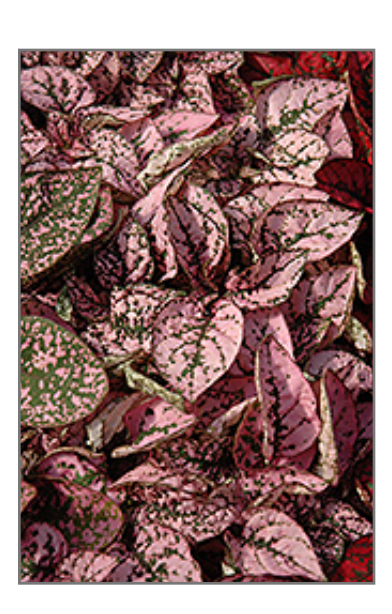
Splash Select Pink Polka Dot Plant foliage

CUMBERLAND 201 Gray Rd (Route 100) Cumberland, ME 04021 1-800-348-8498 207-829-5619