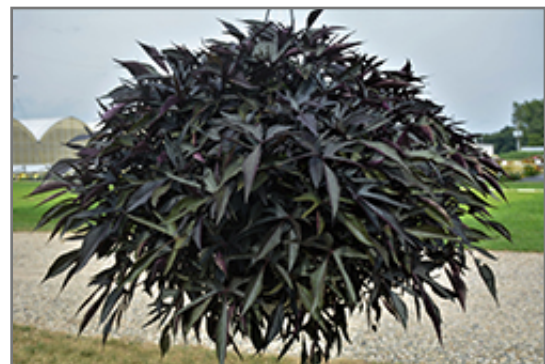
Illusion Midnight Lace Sweet Potato Vine

BRUNSWICK 422 Bath Road Brunswick, ME 04011 1-800-339-8111 207-442-8111