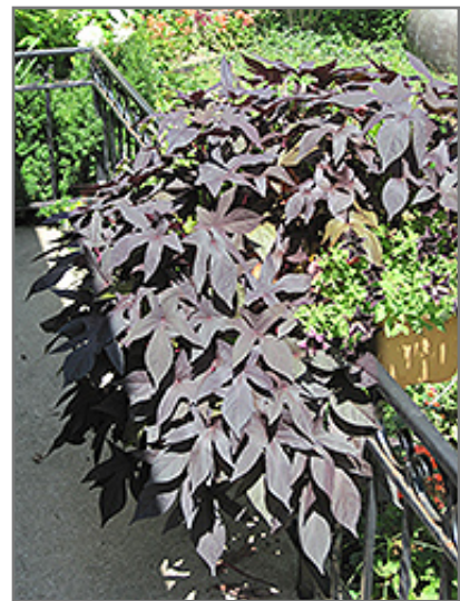
Proven Accents Blackie Sweet Potato Vine