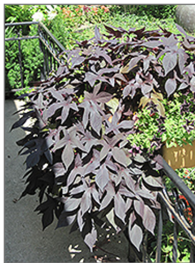
Proven Accents Blackie Sweet Potato Vine