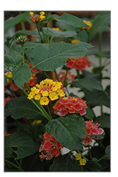
Confetti Lantana flowers