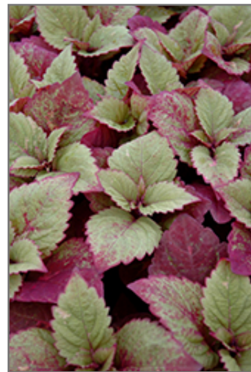
ColorBlaze Royal Glissade Coleus foliage

BRUNSWICK 422 Bath Road Brunswick, ME 04011 1-800-339-8111 207-442-8111