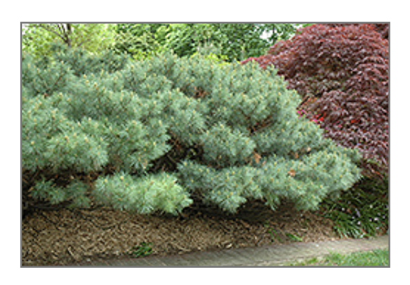
Dwarf White Pine

A high quality evergreen garden shrub with a dense, rounded habit of growth throughout its life, features silvery-blue needles; very compact and slow growing, excellent for form, texture and color detail in home gardens or for rock gardens; needs full sun