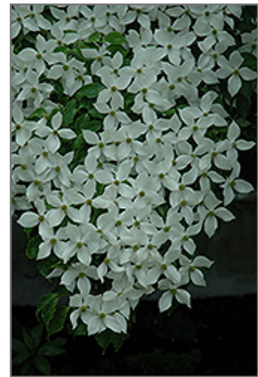
Lustgarten's Weeping Chinese Dogwood flowers

BRUNSWICK 422 Bath Road Brunswick, ME 04011 1-800-339-8111 207-442-8111