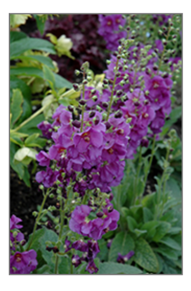
Sugar Plum Mullein flowers

A compact variety with short, well branched spikes of violet-purple blooms with dark purple anthers, rising from a tight rosette of green leaves; the smaller size makes it perfect for containers; deadheading encourages new blooms