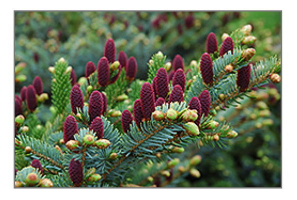
Red Cone Spruce fruit

201 Gray Rd (Route 100) Cumberland, ME 04021 1-800-348-8498 207-829-5619