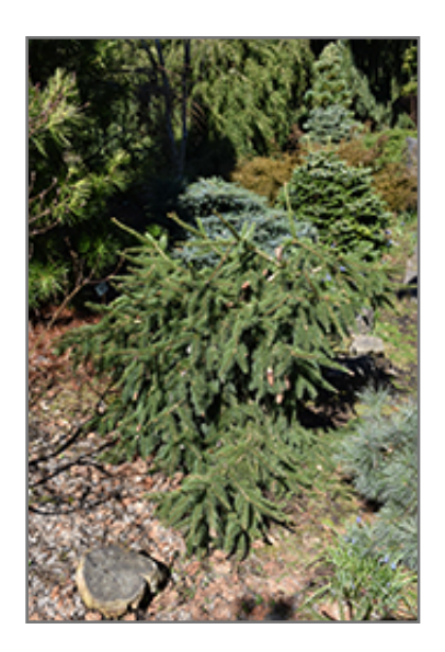
Red Cone Spruce