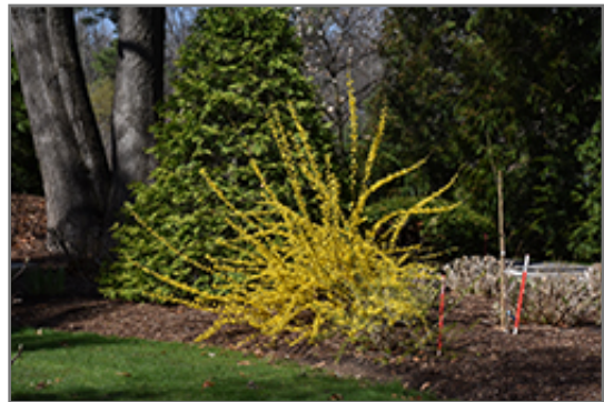
Show Off Forsythia in bloom

BRUNSWICK 422 Bath Road Brunswick, ME 04011 1-800-339-8111 207-442-8111