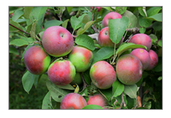
Macintosh Apple fruit

FALMOUTH 89 Foreside Road Falmouth, ME 04105 1-800-244-3860 207-781-3860