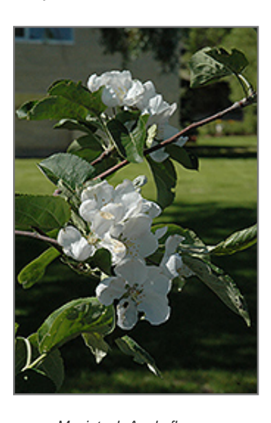
Macintosh Apple flowers

CUMBERLAND 201 Gray Rd (Route 100) Cumberland, ME 04021 1-800-348-8498 207-829-5619