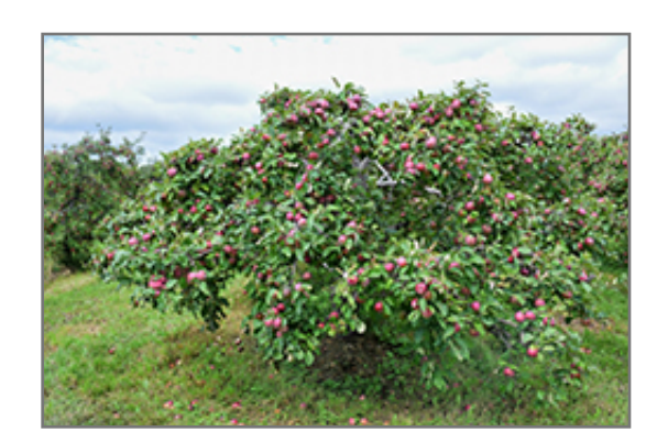
Macintosh Apple fruit

Cortland, Crimson Crisp, Royal Gala, Freedom, Liberty, Macoun, Empire & Honeycrisp