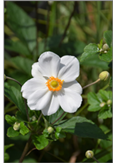
Honorine Jobert Anemone flowers

Honorine Jobert Anemone is a fine choice for the garden, but it is also a good selection for planting in outdoor pots and containers. With its upright habit of growth, it is best suited for use as a 'thriller' in the 'spiller-thriller-filler' container combination; plant it near the center of the pot, surrounded by smaller plants and those that spill over the edges. It is even sizeable enough that it can be grown alone in a suitable container. Note that when growing plants in outdoor containers and baskets, they may require more frequent waterings than they would in the yard or garden.