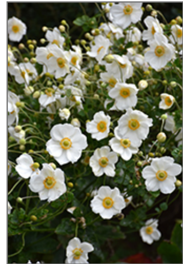
Honorine Jobert Anemone flowers